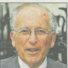
Accused... Lord Janner