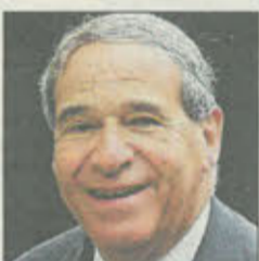
No action... Lord Brittan

Beech's groundless claims were not the only ones made against VIPs in the aftermath of the Savile scandal. The police watchdog oversaw investigations into 37 cases of alleged cover-ups of child sexual abuse by establishment figures. None resulted in any prosecutions.