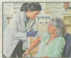
Jab... pharmacist at work