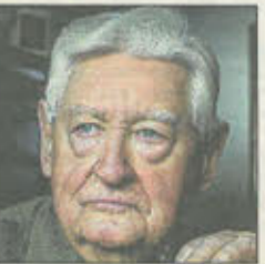
Frail... Lord Bramall