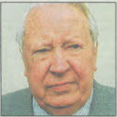
Yacht claim... Ted Heath