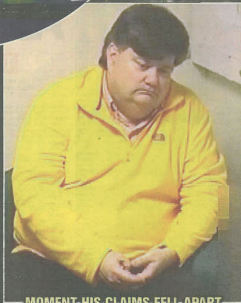
MOMENT-HIS CLAIMS FELL-APART

"At some point his mother came and she wanted us to build her a luxury cabin. She wanted us to go